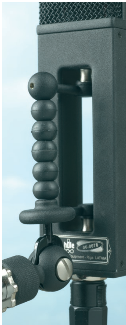
The Black Hole's unique shockmount is eye-catching. In use it works as well as conventional designs and it's arguably less cumbersome.

There is some serious competition in this price range, including the various different models of AKG C414. If you're on a slightly tighter budget you could look at something like the SE Electronics SE4400a.